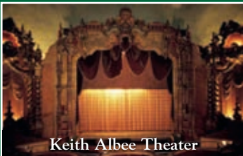
Keith Albee Theater