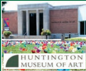
HUNTINGTON MUSEUM OF ART