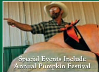
Special Events Include Annual Pumpkin Festival